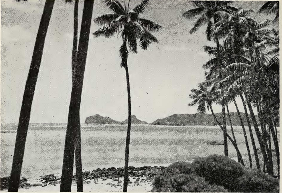
FIG. 2. A view across the lagoon, from the foot of Mt. Lidgbird, showing sands and coral rocks of the seashore. On the horizon is Mt. Eliza with its toothlike form.

acters than the ancestral one. In a series of generations, which may be very small, a new species can evolve, distinct from the ancestral form but practically the same, being only impoverished in its genes (characters). This sort of endemism is of no interest to us. Only paleoendemism can give us solid data about the past of the island and its natural history.